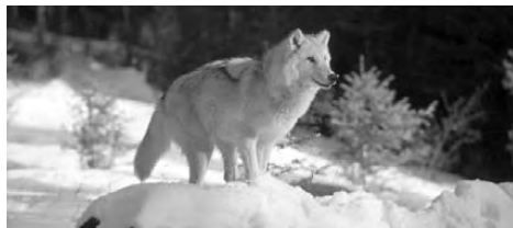
This is a wolf. It lives in Canada.