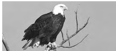
This is an eagle. It lives in Canada.