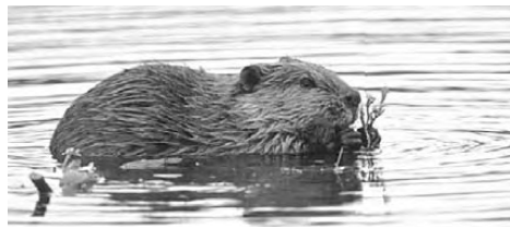
This is a beaver. It lives in Canada.