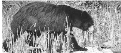
This is a bear. It lives in Canada.