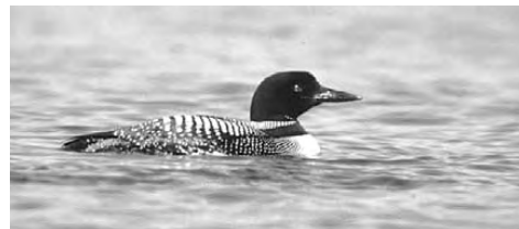
This is a loon. It lives in Canada.