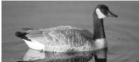
This is a goose. It lives in Canada.