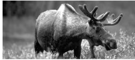
This is a moose. It lives in Canada.